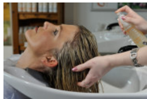
3. Use correct Organic Care Systems shampoo and treatment for the client at the backwash.