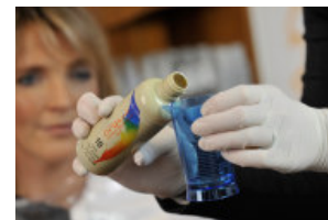
4. Mix colour accurately.