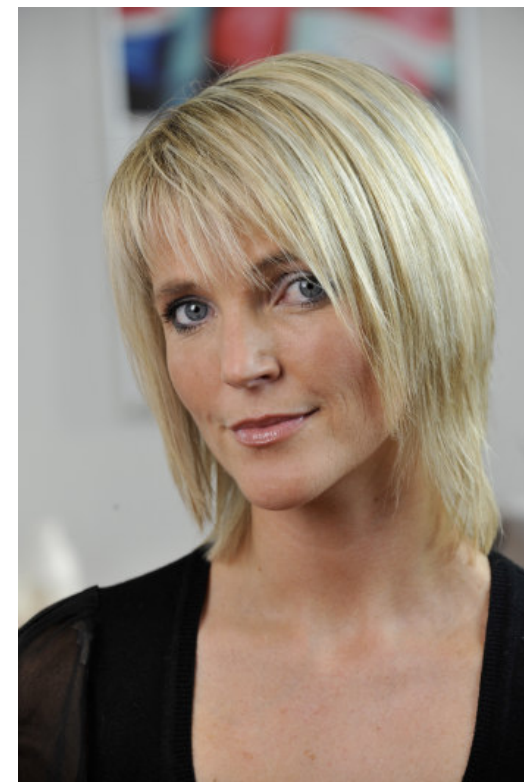
12. Happy client with healthy, natural looking hair.