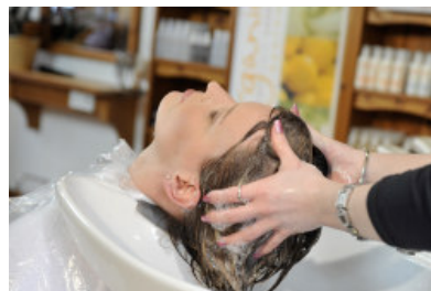
3. Use correct Organic Care Systems shampoo and treatment for the client at the backwash.