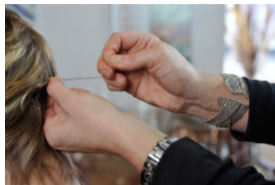
2. Wet stretch test to analyse hair (see Wet Stretch Test Step-by-Step).