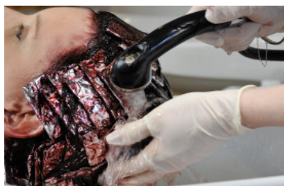
8. Remove the all-over colour first and rinse thoroughly. Then remove the foils and rinse until the water runs clear. This is especially important when using both Intensifiers or Extra Brights and blonde highlights.