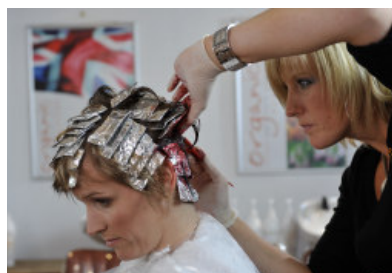
6. Apply all-over colour between the foils.