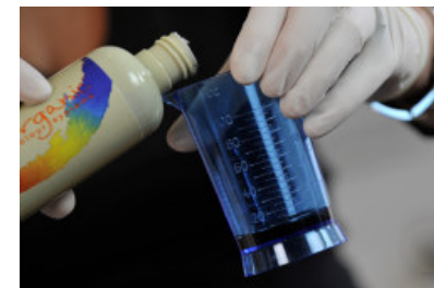
4. Mix colour accurately.