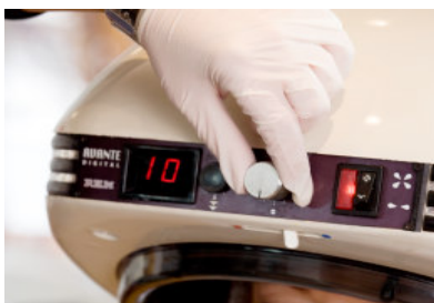
7. Cover hair with plastic cap and put client under moderate heat for 10 minutes. Then allow hair to develop for a further 25 minutes without heat.