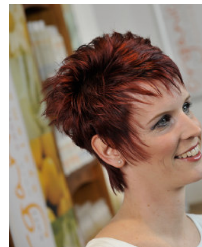
11. Happy client with healthy, natural looking hair.